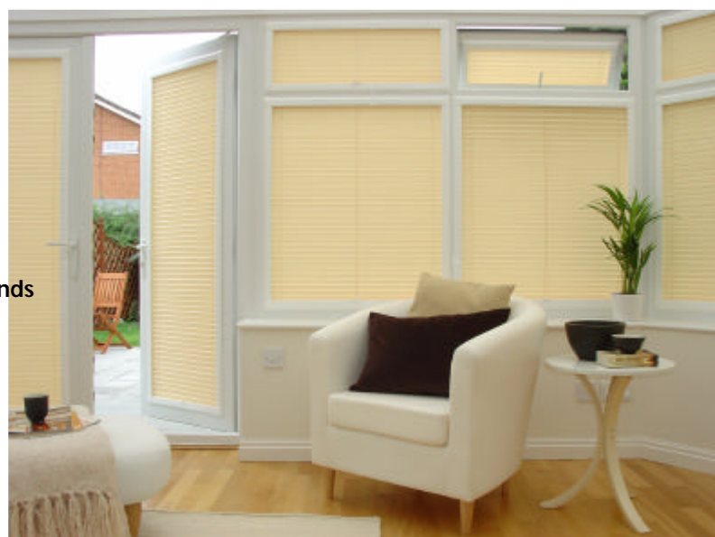
Perfect Fit with Pleated Blinds