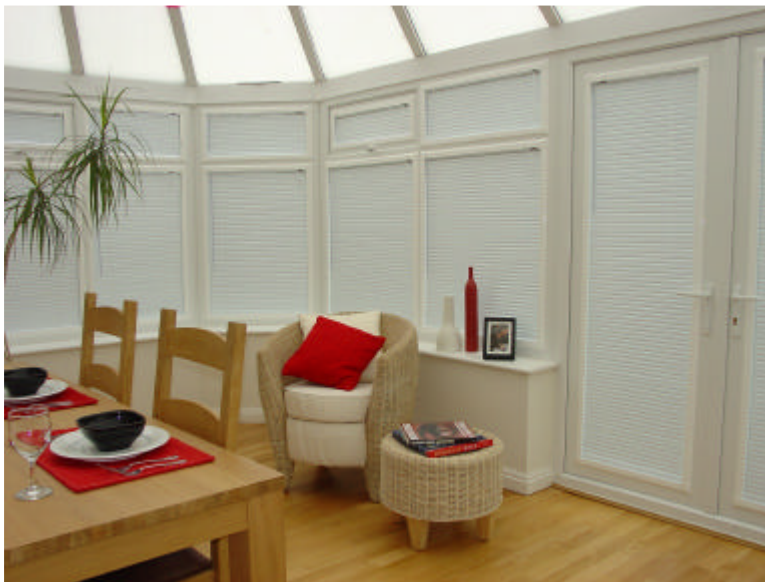
Perfect Fit with Venetian Blinds